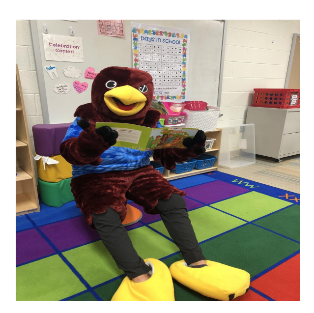
Play, Play, and Play some More!